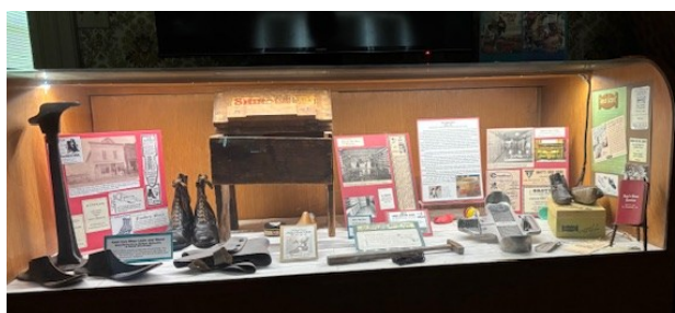
We also created a new display showcasing the many shoe stores and shoe repair shops in South Milwaukee.

So....what IS a recloser? A distribution power line circuit breaker that opens when there is an issue with a power line and then immediately closes again, creating a "blink"