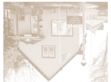
South Milwaukee Historical Society 717 Milwaukee Ave South Milwaukee, WI 53172

Join us for a public celebration of South Milwaukee's art, architecture, culture, history, and people with behind-the-scenes tours of buildings throughout the city... including the Historical Society Museum!