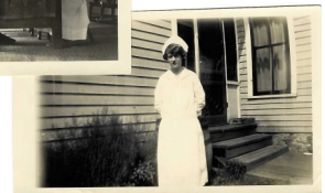
Back of the photo says 1924