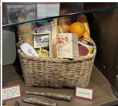
The original reusable shopping bag!

The latest display at the BE Event Center highlights basketmaking in South Milwaukee. Stop by Skyline Deli or the Bucyrus Museum and check it out while you're there. Scan the QR code in the display and you'll be directed to our website where you can learn more.