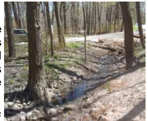
Eb's Creek entering Seven Bridges

The third stream is under ground at Oak Street and Lake Drive, We don't know where it comes from but it enters Eb's Creek east of Lake Drive in Grant Park where it all finally flows into the creek just south of the Seven Bridges parking Area. It's final path to Lake Michigan is one of the most beautiful and scenic trails in the park.