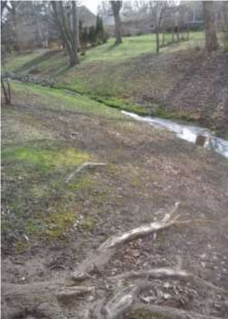
Eb's Creek on Brookdale Drive