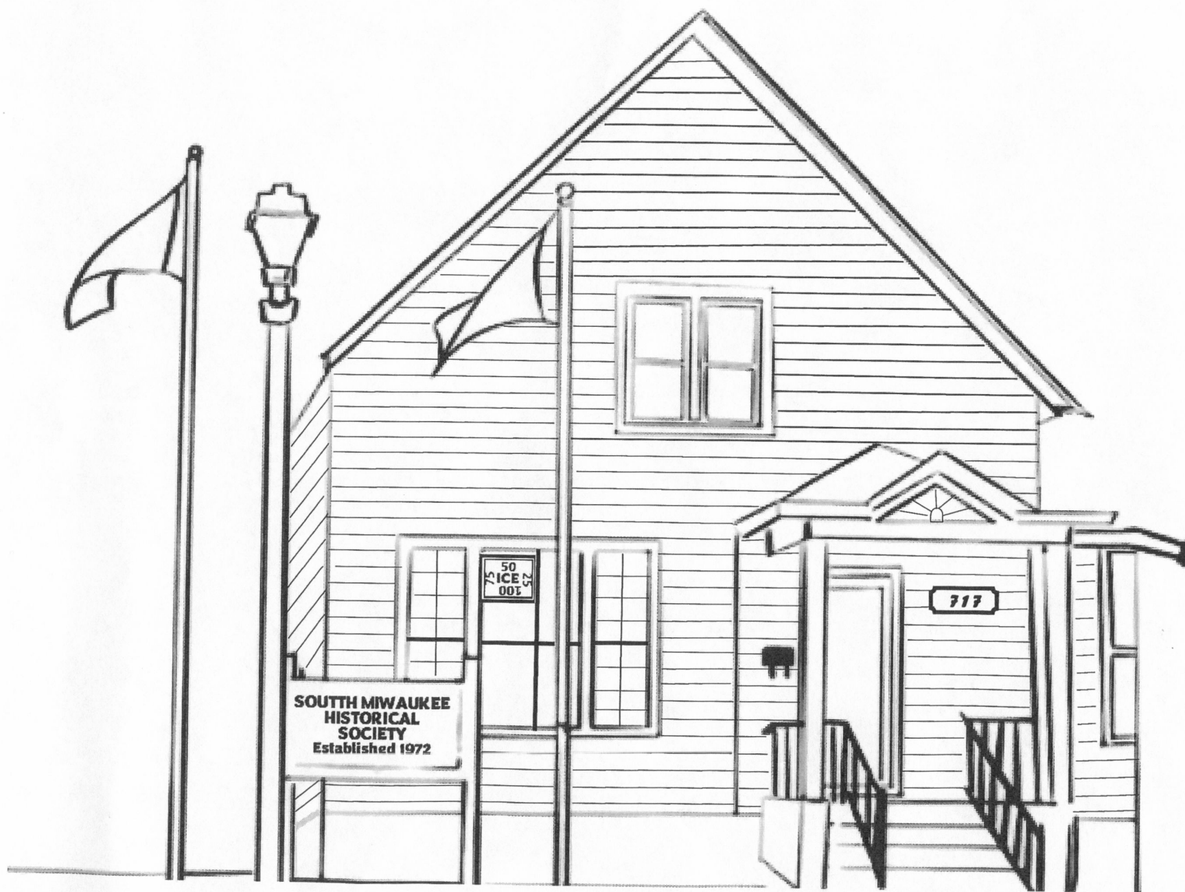
The South Milwaukee Historical Society, located at 717 Milwaukee Avenue, was established in 1972