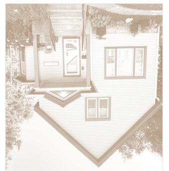
South Milwaukee Historical Society 717 Milwaukee Ave South Milwaukee, WI 53172