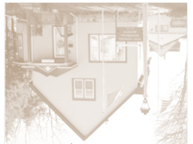
South Milwaukee Historical Society 717 Milwaukee Ave South Milwaukee, WI 53172