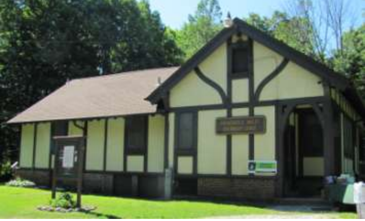
The tour this year included the Wulff Lodge in Grant Park which celebrated it's 100 year anniversary.