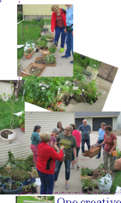
One creative gardener found a new use for plant stakes being trading in!

on May 28 was more popular than ever. Fortunately last year's cold rainy weather didn't make a comeback. This year it was quite summery putting everyone in the mood for gardening. A wide variety of bulbs, herbs, perennials, bushes and even a small tree were up for grabs.