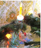
Old ornaments nestled among the lights completed the display