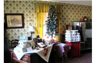
A small tree loaded with vintage ornaments and a desk full of items for sale.

Vintage ornaments and a string of bubble lights wrapped in garland topped the long display case in the living room. Thanks to Richard Thinnies for having the patience to get the bubble lights working!