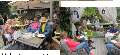
Volunteers get to view the gardens the week before the tour. They posed for a picture at one of the gardens, and got to enjoy an early 'thank you' luncheon at another.