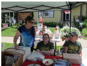
Volunteers at the Society's tent sold tour tickets and raffle tickets for some really great prizes