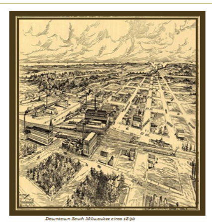
South Milwaukee Historical Society