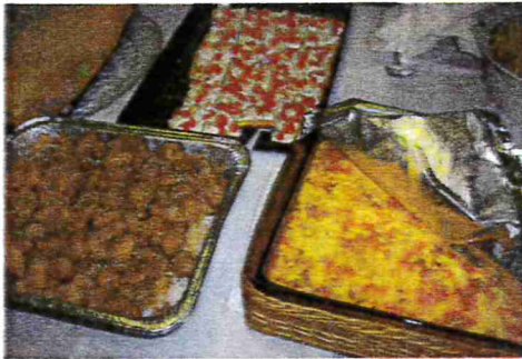
Kinda makes your mouth water doesn't it?

The Spring Pot Luck was held on May 9th at the First Congregational Church. As always there was a wonderful array of homemade food and good fellowship!