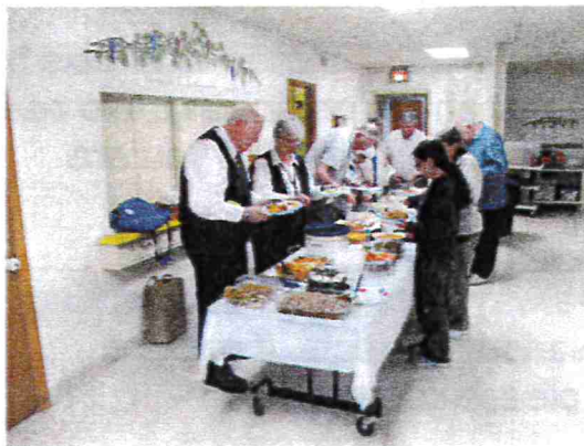
Too many choices!!!