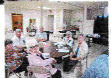
When do we eat???