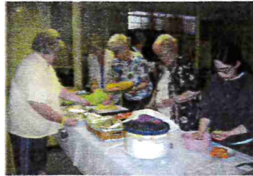
Making sure everything is just right!