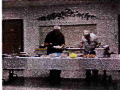
Waaaaay too many choices!