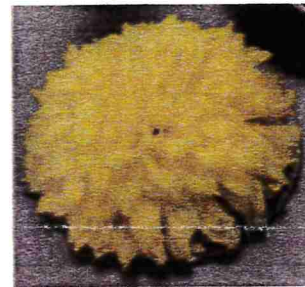
The aptly named dinner plate dahlia!

On September 24th a new plaque honoring Bucyrus was installed at Heritage Park on the corner of 10th & Milwaukee Avenues. Unfortunately, bad weather caused the ceremony to be moved inside to the Bucyrus Heritage Museum but it was well attended by local dignitaries, current & retired employees and general well wishers. Below is copy of the text on the plaque.