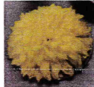
The aptly named dinner plate dahlia!

On September 24th a new plaque honoring Bucyrus was installed at Heritage Park on the corner of 10th & Milwaukee Avenues. Unfortunately, bad weather caused the ceremony to be moved inside to the Bucyrus Heritage Museum but it was well attended by local dignitaries, current & retired employees and general well wishers. Below is copy of the text on the plaque.