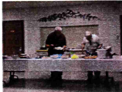
Waaaaay too many choices!