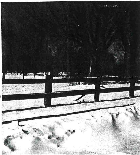
Grant Park in Winter