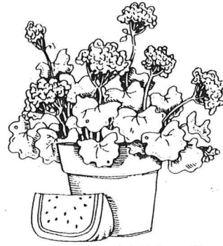
Delafield Stamp Co.

In small bowl, bury leaves in sugar. Cover and set aside for three days. Brew tea as desired and add to pitcher filled with ice. Add flavored sugar. Strain out leaves and serve. Yield: 2 quarts.